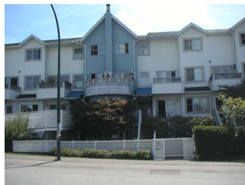
ENF's first building, Alma Blackwell at 1656 Adanac Street, Vancouver, B.C.